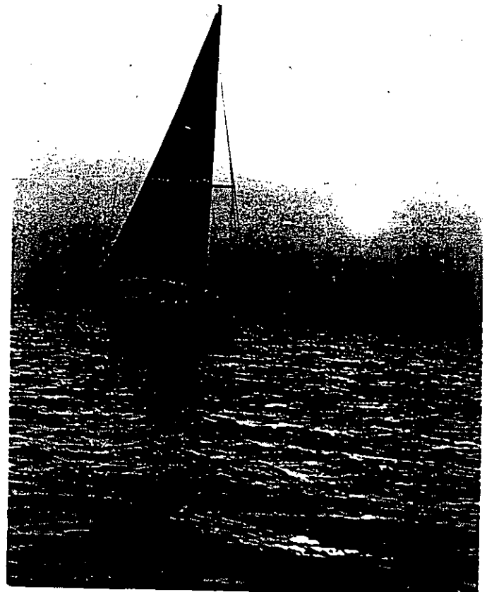
welcome back! HAKUNA MATATA